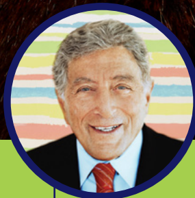
Tony Bennett: Viva Duets