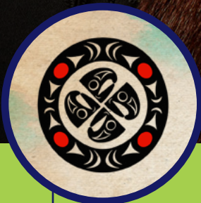
Origins: The Last Reefnetters