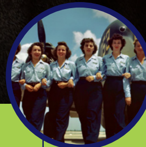
Women of World War II: The Untold Stories