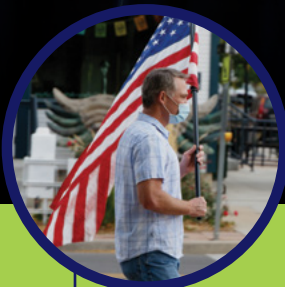
One Person, One Vote?