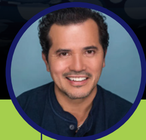
VOCES American Historia: The Untold History of Latinos